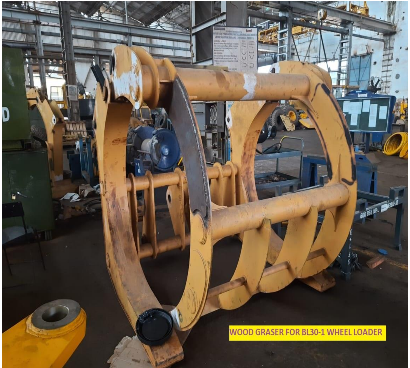
WOOD GRASER FOR BL30-1 WHEEL LOADER

(A Govt. of India Mini Ratna Company under Ministry of Defence) “BEML SOUDHA”, 23/1, 4th Main, S. R. Nagar, BANGALORE – 560 027